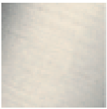
platinum matte 36 315 985-06

More custom finish options are available via special production (xTra Service). Please see our finish matrix for availability and pricing or contact a Dornbracht representative.